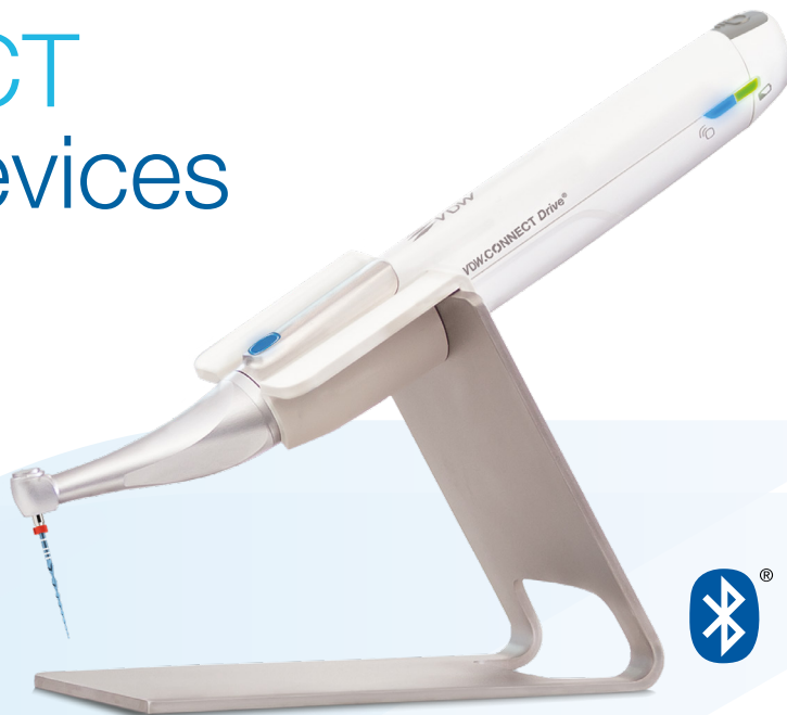
VDW.CONNECT Drive® Smart cordless endo motor