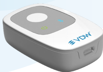
VDW.CONNECT Locate® Smart apex locator