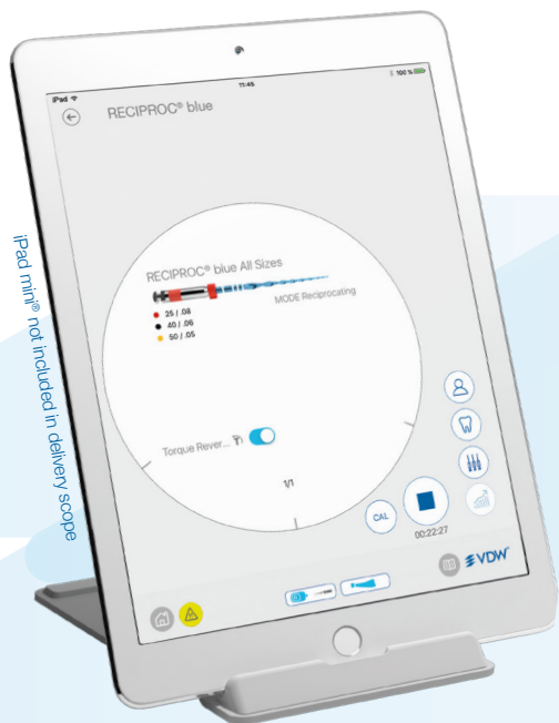
VDW.CONNECT® App Your connection to modern endo